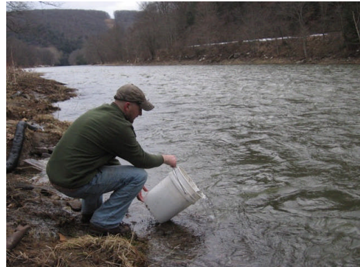
On April 19 2011 OCTU stocked trophy trout at both Oil Creek and Little Sandy project areas.